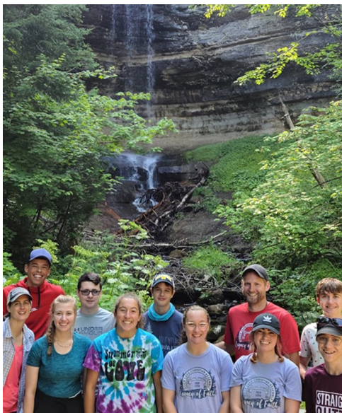
Rock Lake Christian Assembly 2021 U.P. Hike