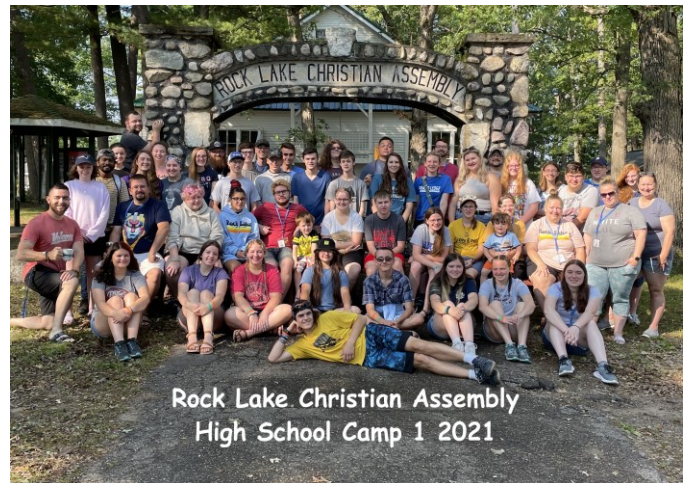
Rock Lake Christian Assembly High School Camp 1 2021