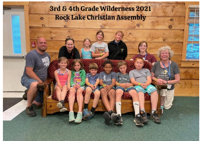
3rd & 4th Grade Wilderness 2021 Rock Lake Christian Assembly