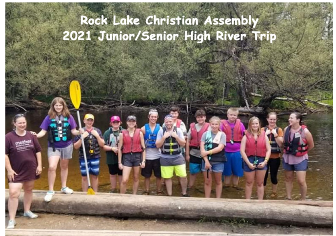
Rock Lake Christian Assembly 2021 Junior/Senior High River Trip