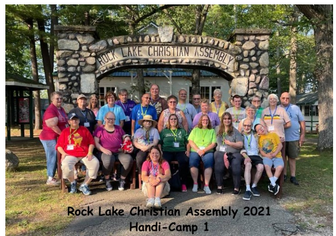
Rock Lake Christian Assembly 2021 Handi-Camp 1