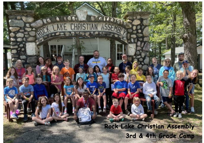
Rock Lake Christian Assembly 3rd & 4th Grade Camp