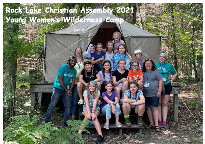
Rock Lake Christian Assembly 2021 Young Women's Wilderness Camp