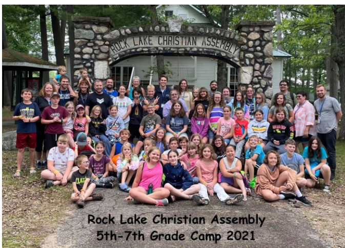
Rock Lake Christian Assembly 5th-7th Grade Camp 2021