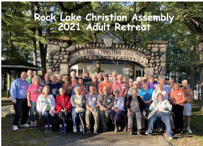
Rock Lake Christian Assembly 2021 Adult Retreat