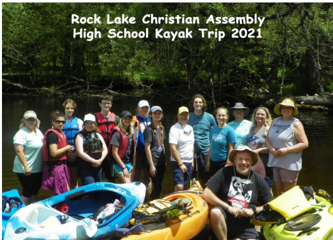
Rock Lake Christian Assembly High School Kayak Trip 2021