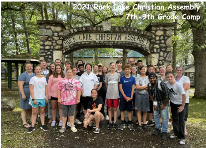
2021 Rock Lake Christian Assembly 7th-9th Grade Camp