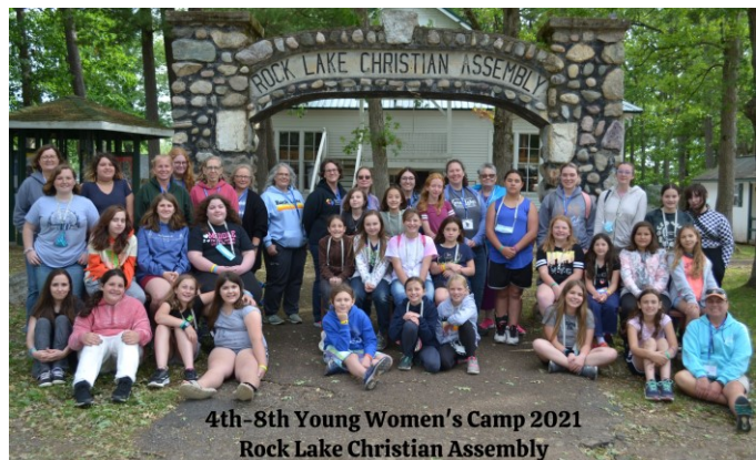
4th-8th Young Women's Camp 2021 Rock Lake Christian Assembly