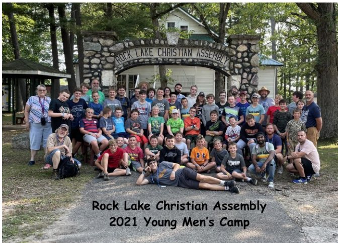
Rock Lake Christian Assembly 2021 Young Men's Camp