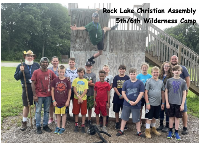
Rock Lake Christian Assembly 5th/6th Wilderness Camp